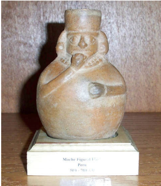
Moche Figural flask – Peru

As most of you know, I collect ancient artifacts and periodically present them in my newsletter. Well, it's time to share my latest acquisitions.