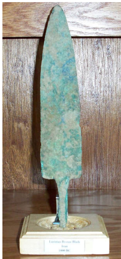
Luristan Bronze Blade – Iran