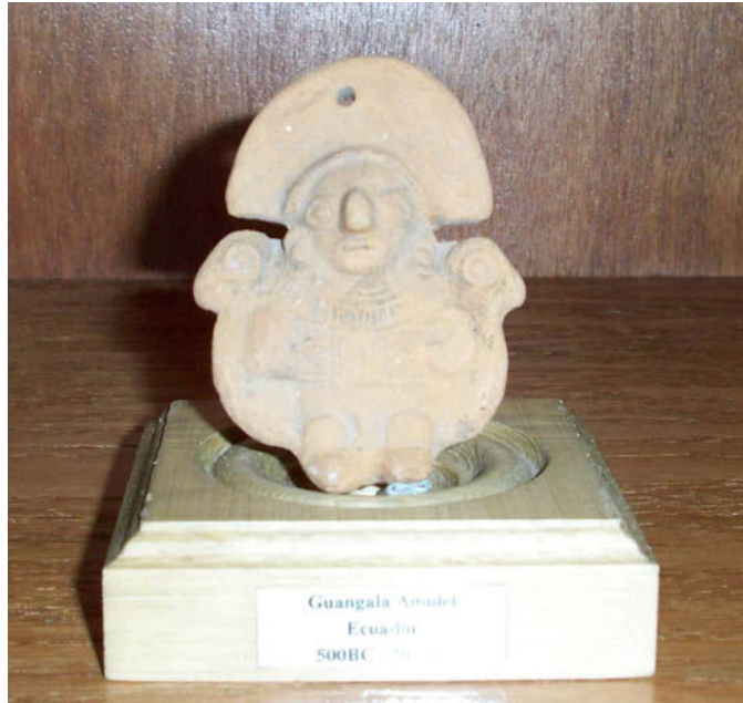
Guangala Amulet - Ecuador