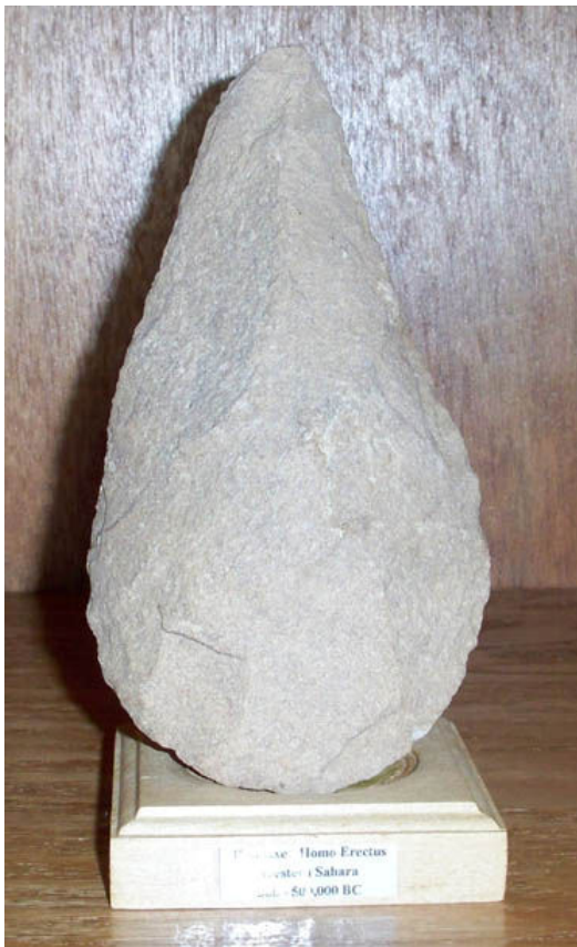
Homo Erectus Handaxe – West Sahara