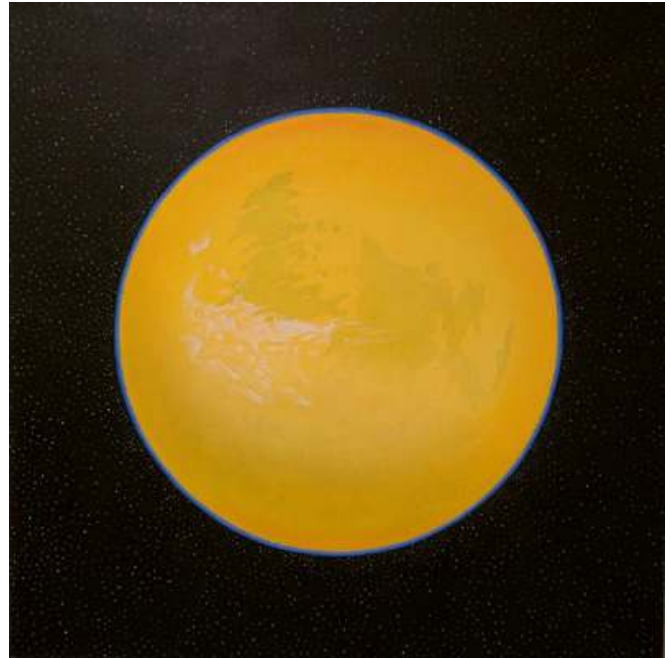
The Meaning of 'Space Time Infinity'